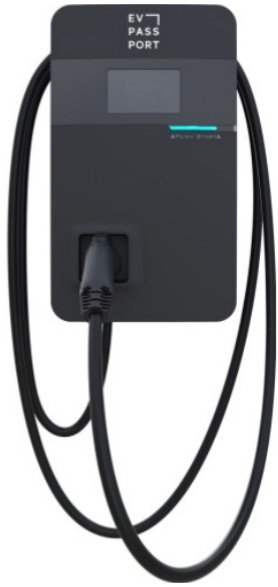
Level 2 Charger