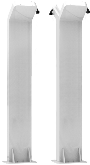
Rosa Pedestal Add-on